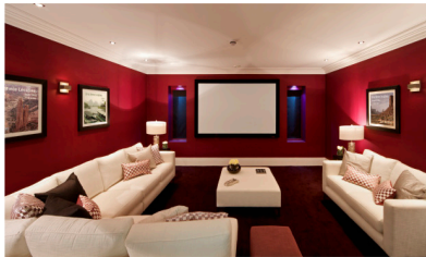
BASEMENT REMODEL OR ADDITION