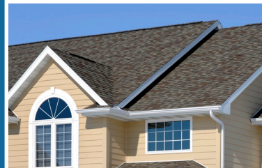
INSTALL NEW SIDING