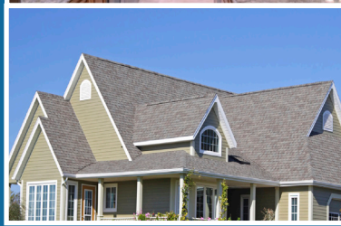
ROOF & WINDOW REPLACEMENT