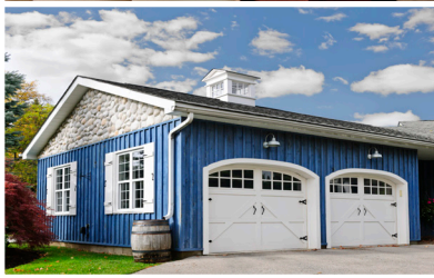
ADD A GARAGE OR BARN