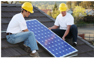
SOLAR PANEL INSTALLATION